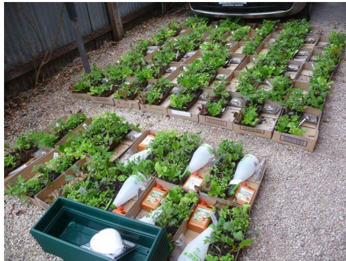
60 kits, which included seedlings and fertiliser, all laid out in the Wilson's carport prior to delivery. Each kit included 4 planter boxes – one shown above.

The kits were delivered on the morning of Saturday 31 August.