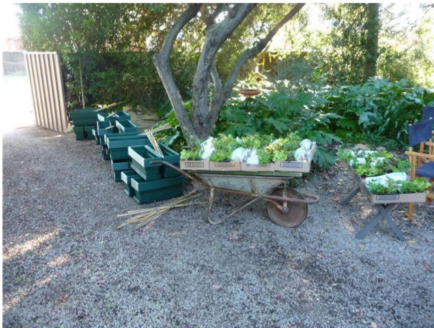
Organised and ready to go