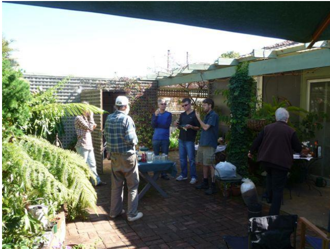
Our after-delivery debrief session. Crowning a successful and very pleasant morning with laughs, food, wine and stories.