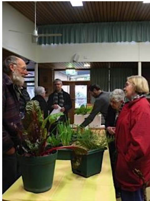
At the training session on 3 August

The kits were delivered on the morning of Saturday 31 August.