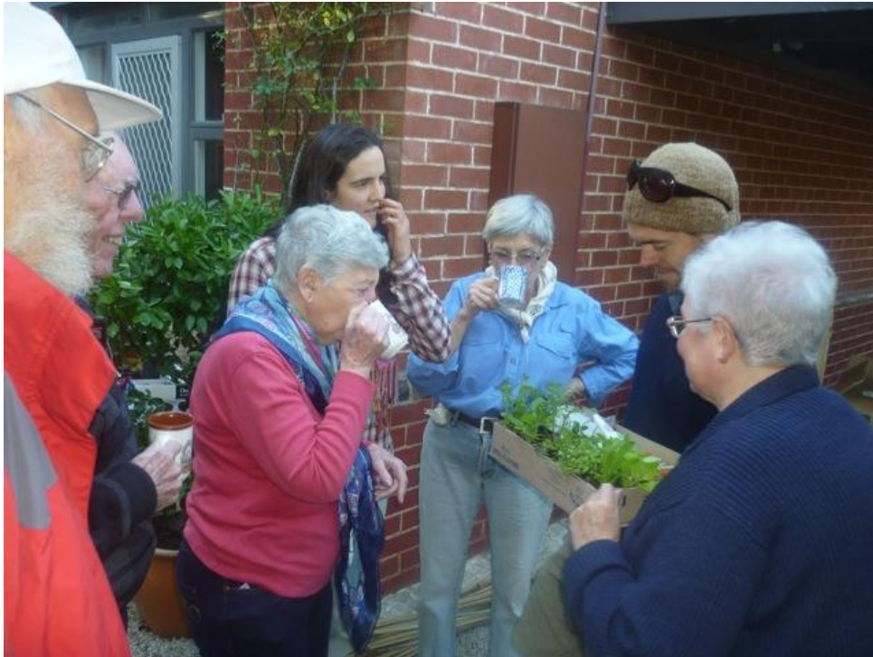
The essential muffin and coffee before we started deliveries