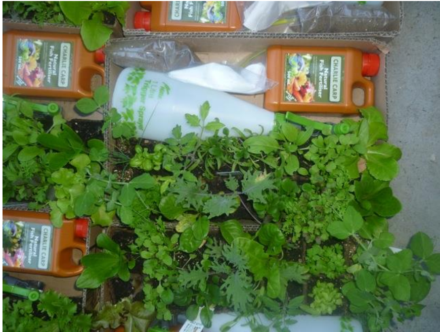
An aerial view of a seedling box - 16 organic seedlings, two organic fertilisers, spray bottle for the Charlie Carp and a dust mask (protection while filling the planter boxes). Seedlings came from Diana Bickford - recently on Gardening Australia (31 August)