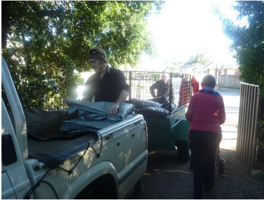
Together with the potting soil - from SA Composters